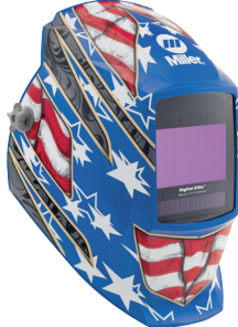
Stars and Stripes™ III 28975