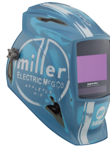
Vintage Roadster™ 289764