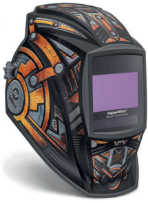
Gear Box™ 289844