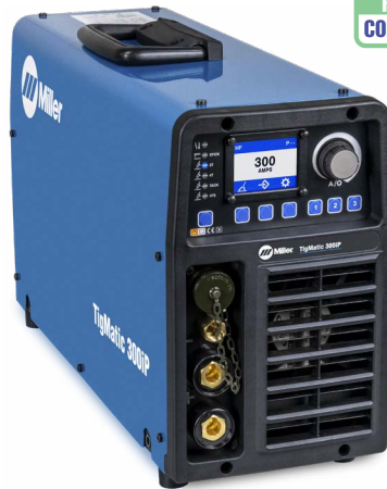
TigMatic® 300iP Machine only