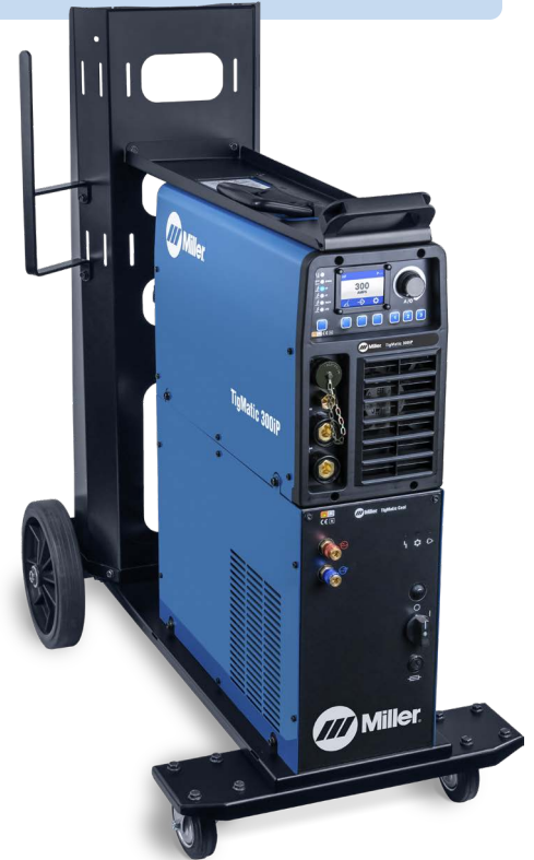
TigMatic® 300iP with Cooler and Trolley