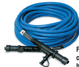
ProHeat liquid-cooled induction heating cable.

Improved working environment is created during welding. Welders are not exposed to open flame, explosive gases and hot elements associated with fuel gas heating and resistance heating.