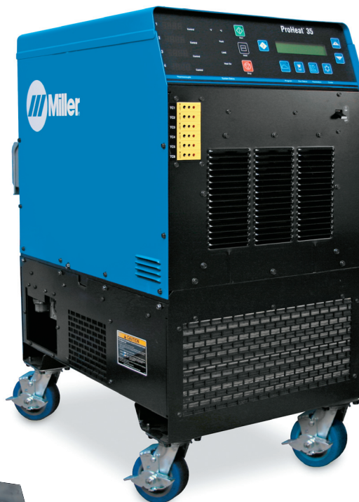
ProHeat 35 power source (907690) shown with heavy-duty induction cooler (301298) and optional running gear (195436).